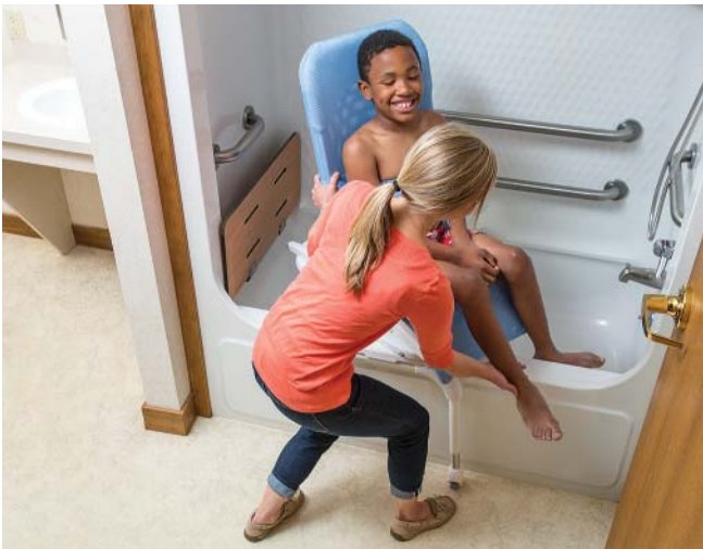
3. As the bath chair rotates, it continues to move back over the tub. Gently lift the client's legs to clear the edge of the tub.