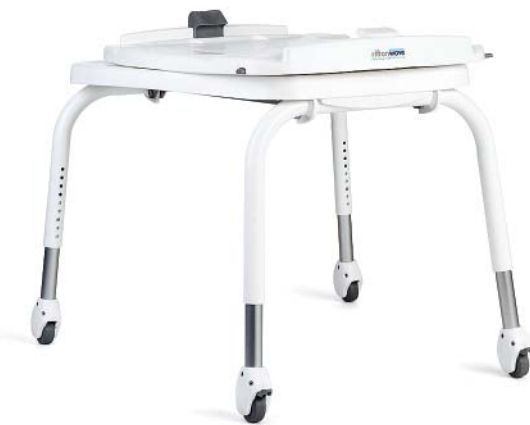
Tub transfer base