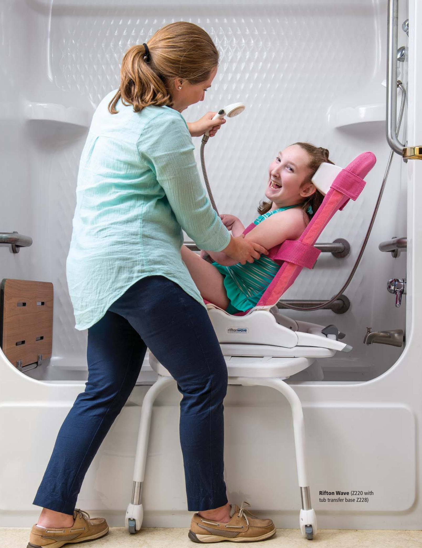
Rifton Wave (Z220 with tub transfer base Z228)