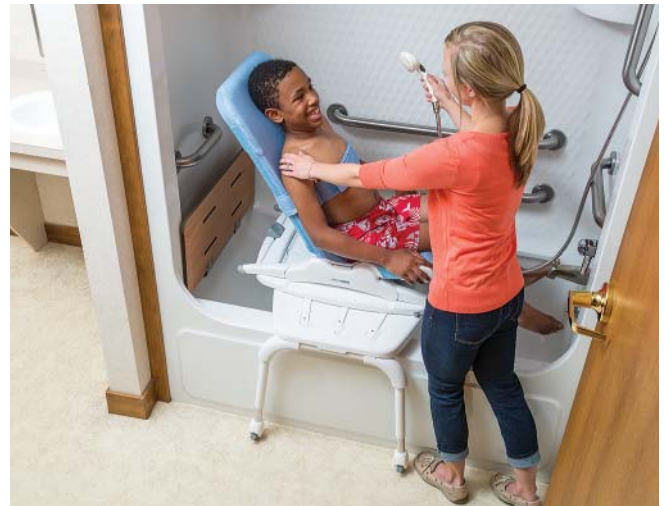
4. In the final position the bath chair is over the tub and can be adjusted as desired for showering.