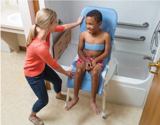
1. With the client secured in the chair, push the transfer base to the back of the tub as far as it will go and lock the wheels.